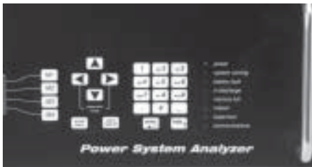
BMS2000V Key Pad

The BMS 2000V Battery Management System from Solidstate Controls gives Users the ability to Proactively monitor and analyze the condition of their batteries in order to Predict impending problems with their battery system, and take the appropriate Preventive action.