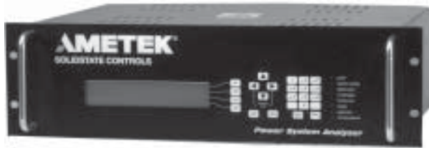
Front view of BMS2000V